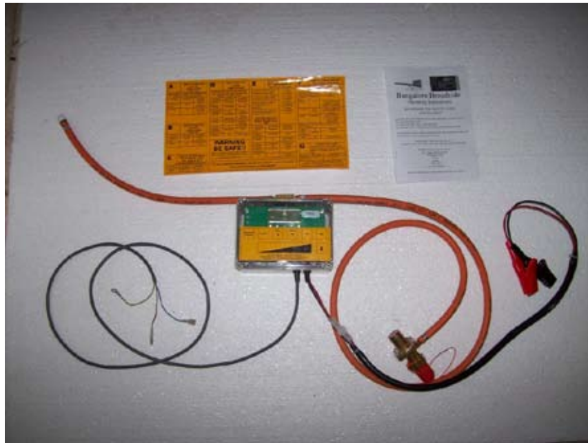
Figure 1. Contents of the B17 Bangalore Retro-Fit Control Box Kit

Figure 1 shows the contents of the B17 Bangalore Retro-Fit Control Box Kit.